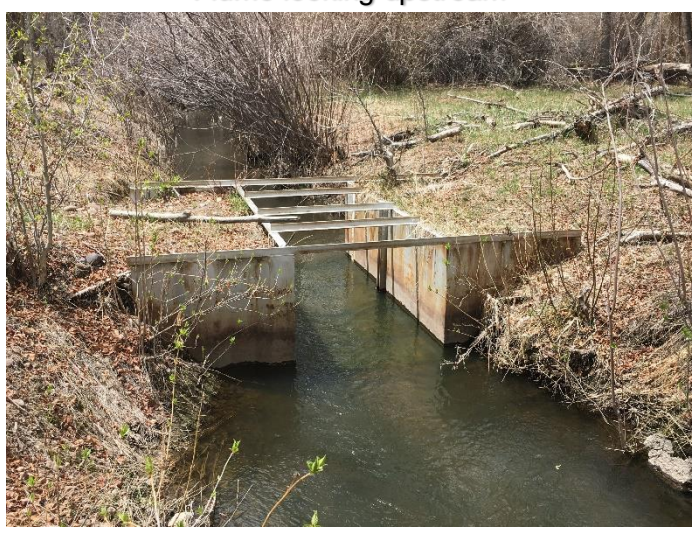
RIO GRANDE DIVERSION INFRASTRUCTURE INVENTORY