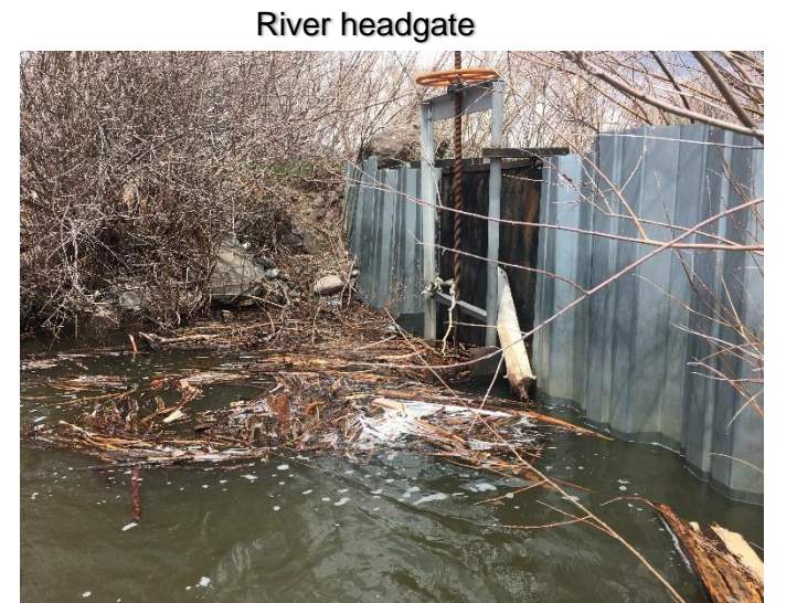
River headgate and diversion dam