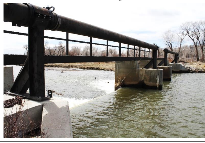
Diversion dam looking downstream