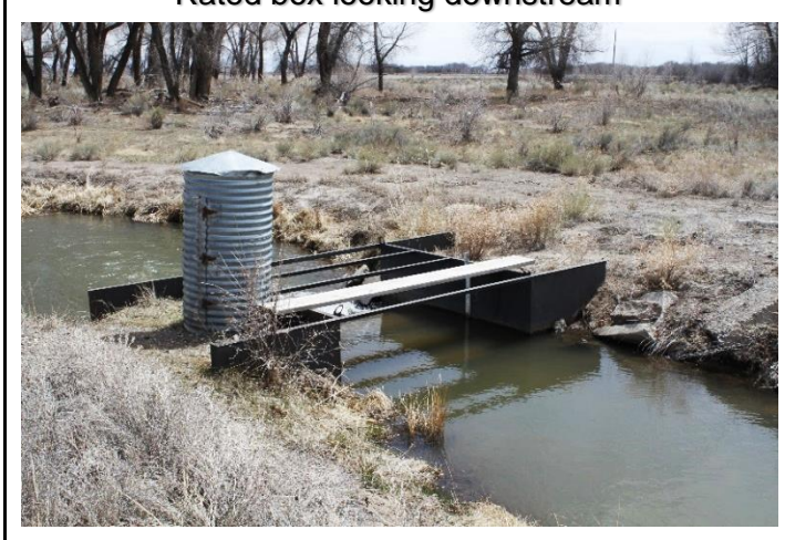
Rated box looking downstream