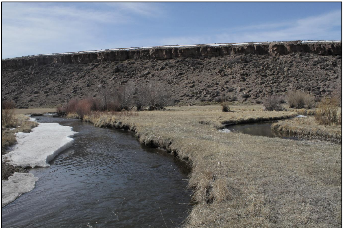
Potential meander cutoff upstream of ditch