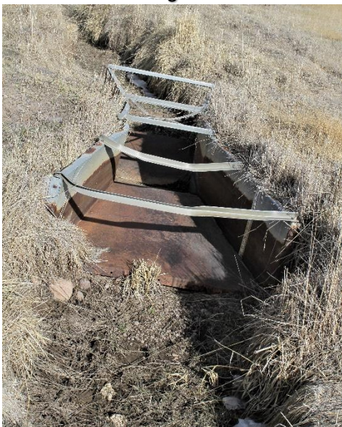
Flume looking downstream