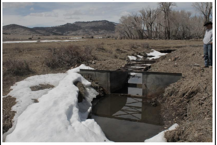
SAGUACHE CREEK DIVERSION INFRASTRUCTURE INVENTORY