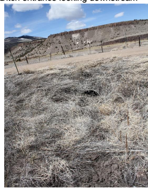
Ditch entrance looking downstream