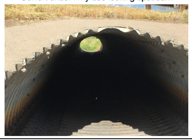
Culvert under Hwy 285 looking upstream