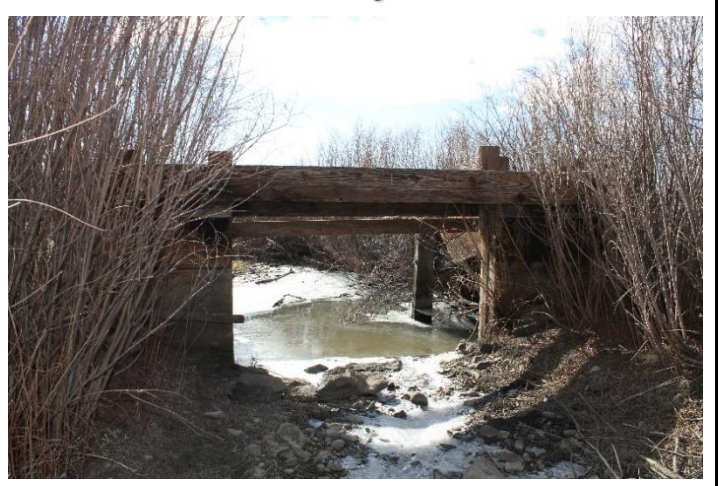
Diversion dam looking downstream