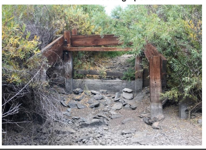
Diversion dam looking upstream