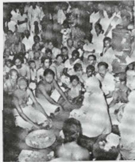
Address 114 Anniversary Celebrations