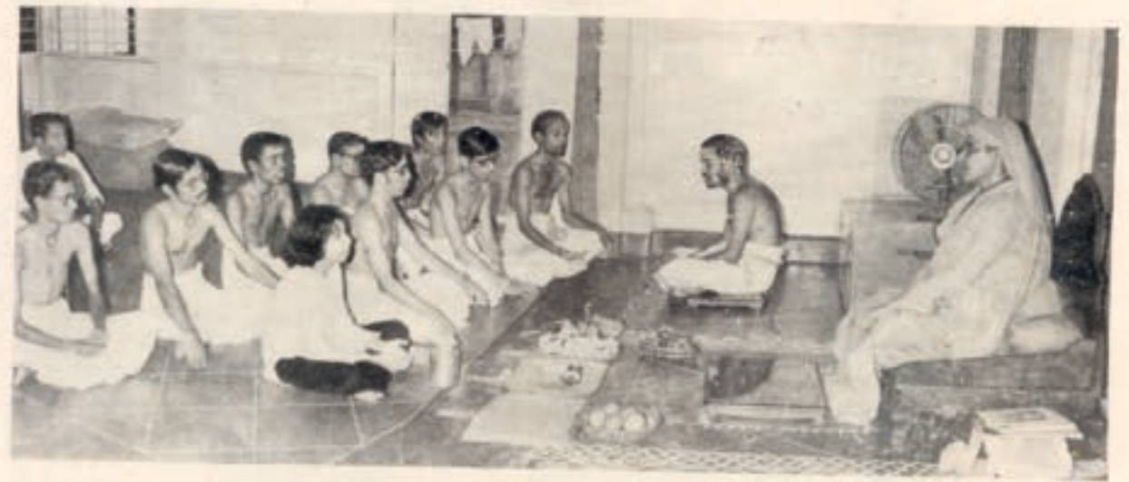
Daily Veda classes in progress at Our Sri Peetam.

In the Presence of the Embodiment of Truth.