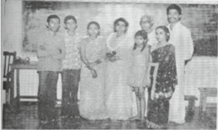
. . . of a small worldly family (This photograph was taken just the night before Ms took sannyasa).