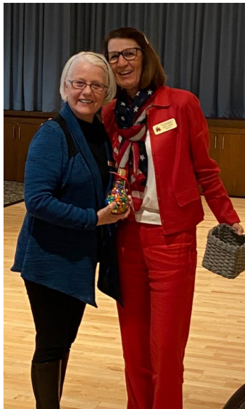
winner of the On Time Lunch Registration prize