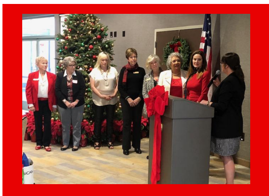
Installation of TARWF 2018 Board of Directors.

Tustin Area Republican Women Federated Cordially Invite You To Our