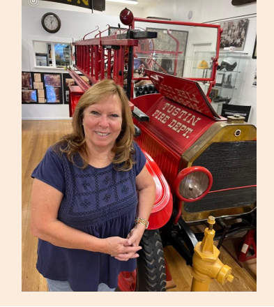
of the Tustin Historical Society has agreed to contribute articles for our newsletter regarding Tustin history and Tustin armed forces service personnel.