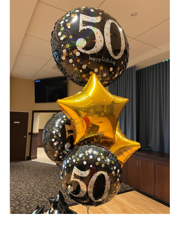
Celebrating 50 Year Anniversary of Tustin Area Republican Women Federated