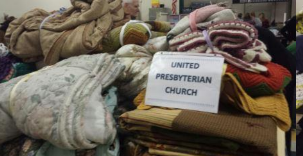
Quilts made from pieces of old blankets