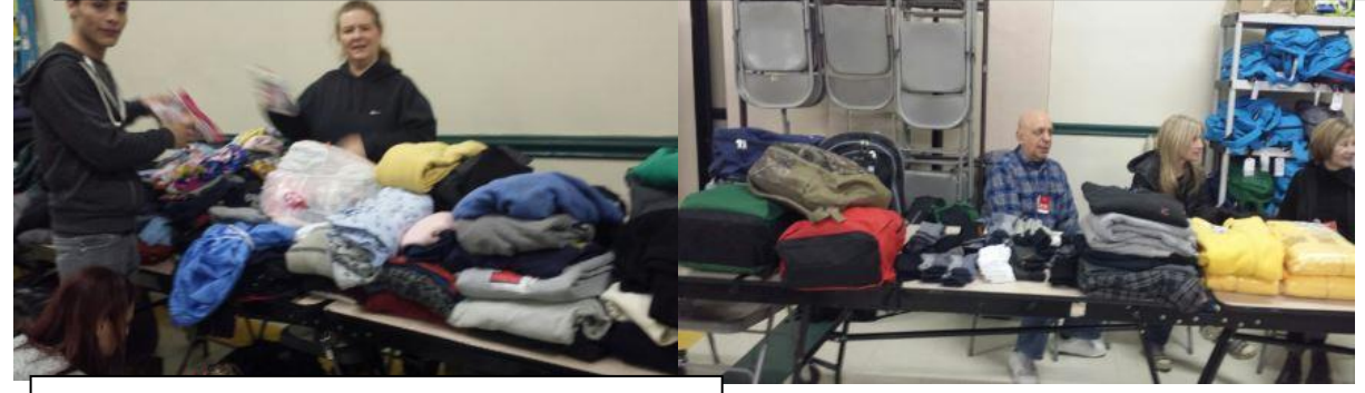
Catholic Charities had piles of warm clothing