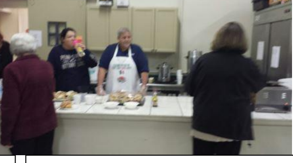
Hot and cold lunches were served to all