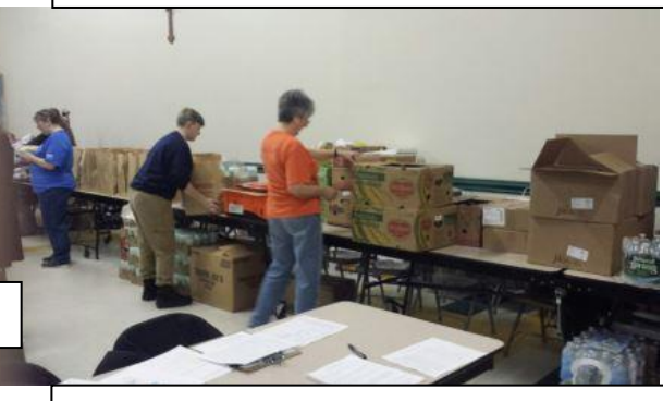
NORWESCAP filling bags to distribute food