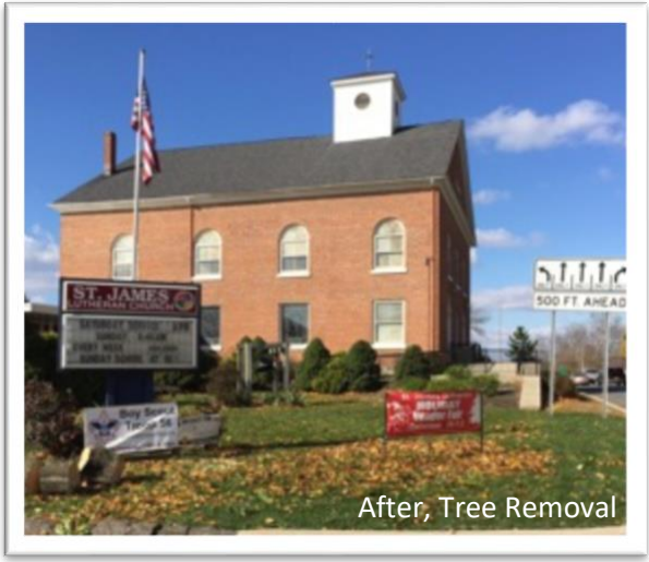
After, Tree Removal