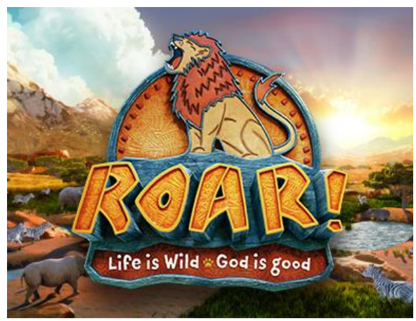
Save the Dates: July 8 - 12

Like prior years, we will also be looking for senior youth and adult assistance to make the event fun, safe and exciting for the children!