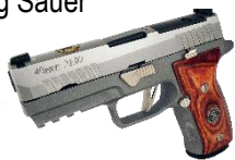
P320 NRA Custom Works 9mm