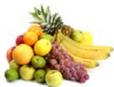
Fruits, especially whole fruits