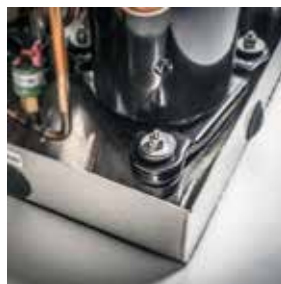
Stainless-steel drain pan