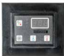
Compact Dometic digital display/control