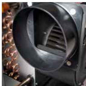
High-velocity, rotatable blower for horizontal or vertical installation