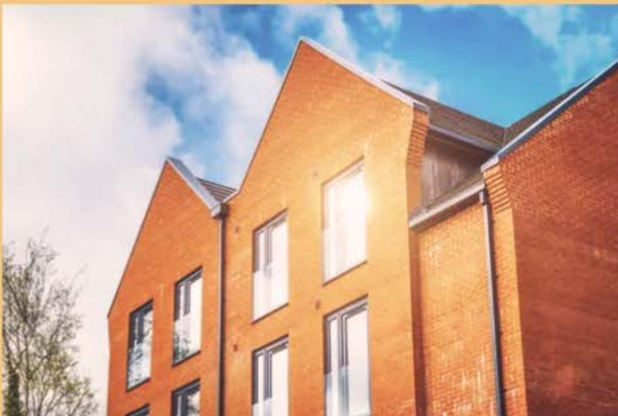
Plot Size - 1785 South - West Facing

www.vedhhomes.com Contact - 9442388832 / whatsapp +65-81390890