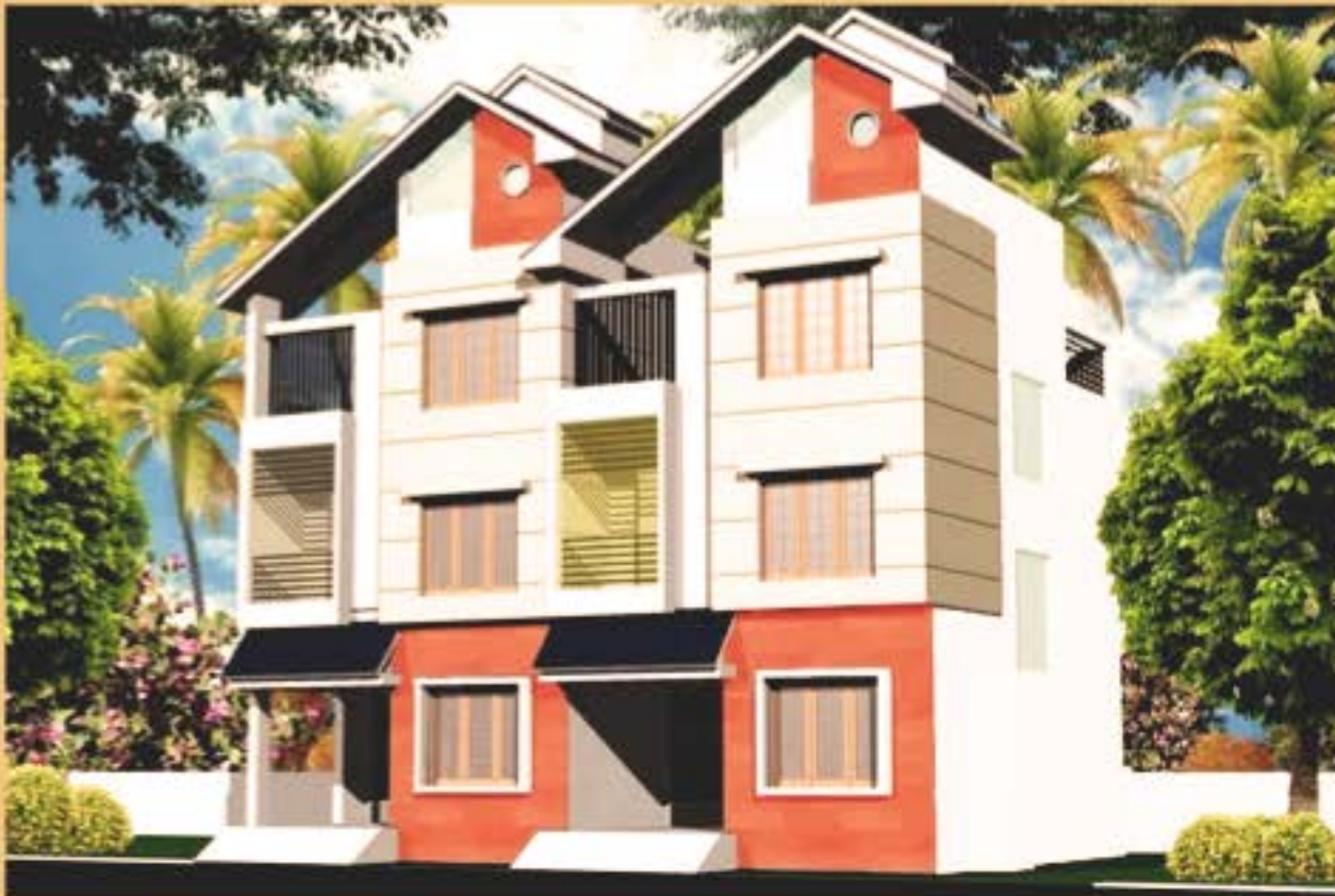
Elevation View Front