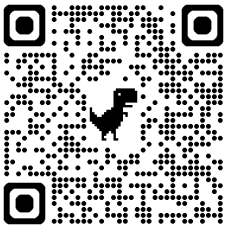
Parent Handbook QR code

The Parent Handbook has additional information on illnesses and when students can return to school following an illness. Please review our illness policy.