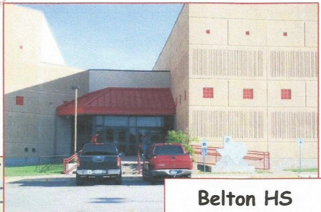
Belton HS Gym Entrance