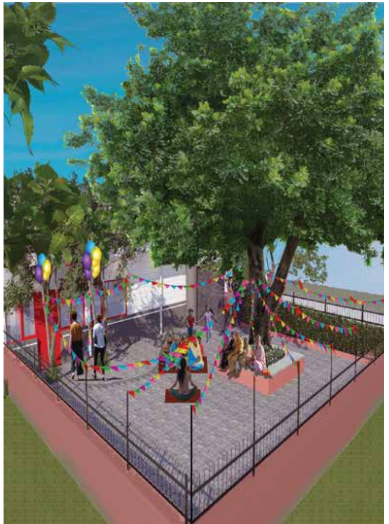
3D DESIGN OF RE PURPOSED INFRASTRUCTURE

PVR NEST is in discussions with multiple agencies who can create these new Garima Grih centres.