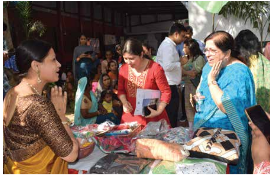
The first 'Garima Shakti Mela' organised by community women for women in association with READ India

Women's economic participation and empowerment are fundamental to strengthening women's rights and enabling them to have control over their lives and exert influence in society. Skill development that enhances livelihood opportunities for women improves the productivity of the economy and participation of women. Trained women tailors mentored at the Tailoring and Stitching programme run by READ India are now being nurtured as budding entrepreneurs by giving them a platform to showcase their creative skills through the display and sale of eco-friendly and sustainable products like tote bags, coin bags, cushion covers and daily wears for women that they make.