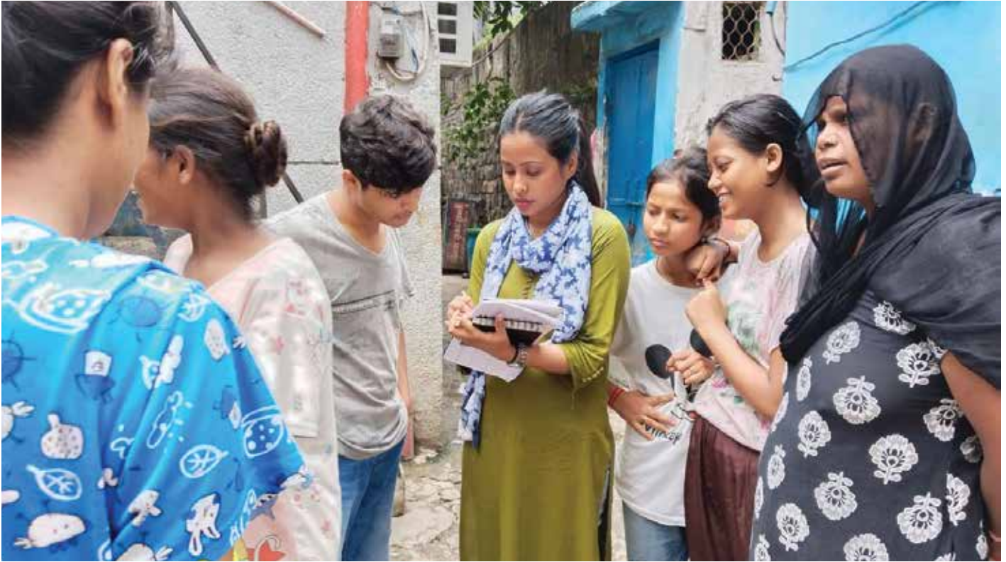
Skill registration Booth camp