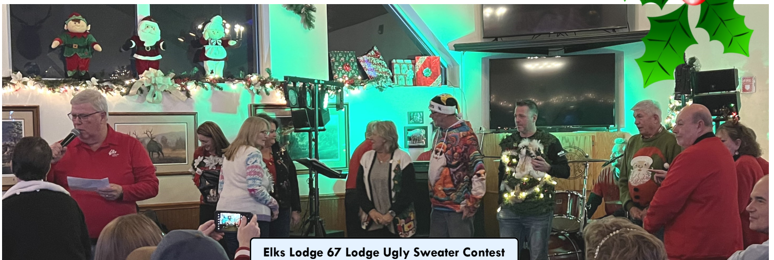
Elks Lodge 67 Lodge Ugly Sweater Contest