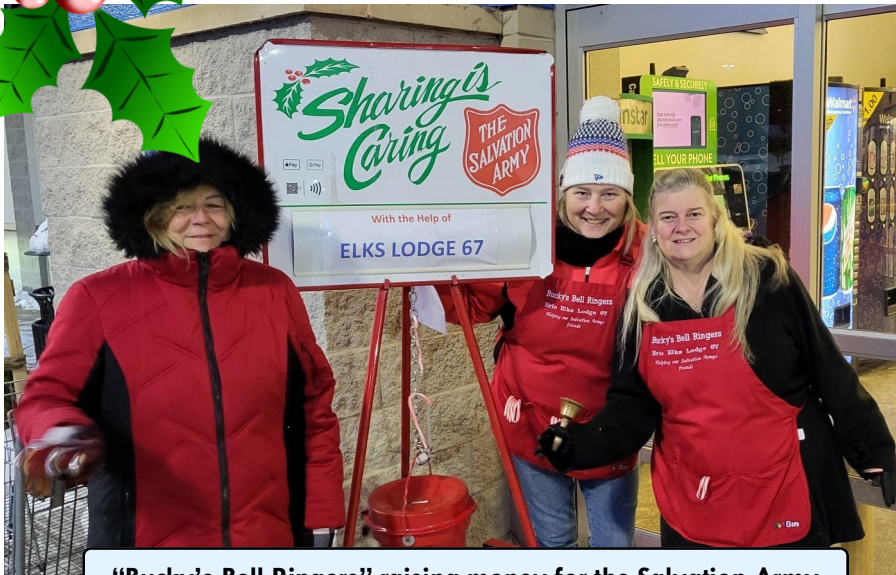
"Bucky's Bell Ringers" raising money for the Salvation Army