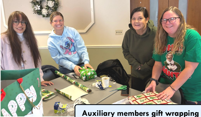
Auxiliary members gift wrapping donations from the Angel Tree, despite the weather