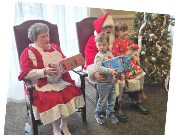
Breakfast with Santa December 14th, 2024