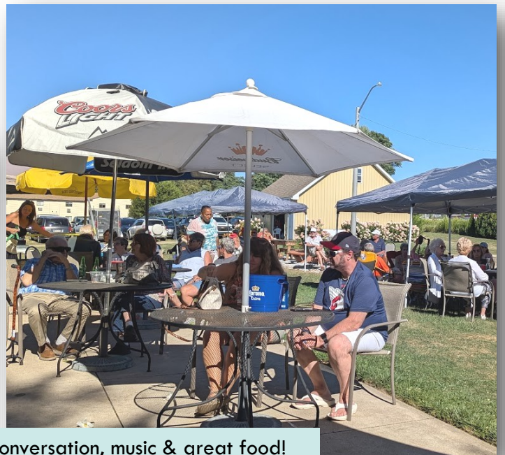
A trifecta; conversation, music & great food!

Elks Care - Elks Share Elks Care - Elks Share Elks Care - Elks Share Elks Care - Elks Share