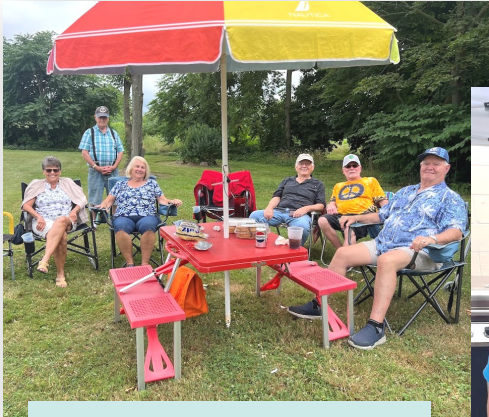
Enjoying the greenspace!