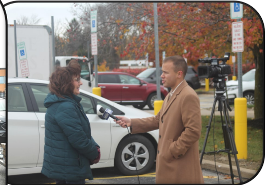
Elks Lodge 67 Volunteers utilized the ENF Freedom Grant to host 57 Vets plus caregivers from the Erie VA Medical Center, PA Soldiers' and Sailors' Home, and other local nursing homes for an afternoon of socialization, a great meal, games, and Walmart gift cards. Everyone was a winner!