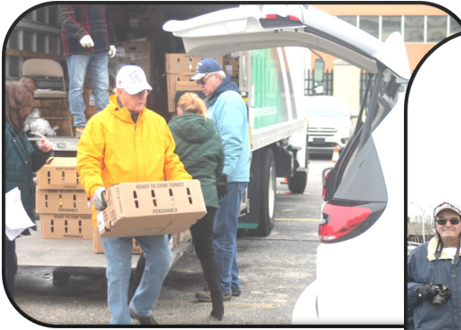
Elks Lodge 67 Volunteers at "Operation Turkey" at the Erie VA. 202 Thanksgiving Meal Crates were distributed to Veterans, sponsored by the ENF Beacon Grant.