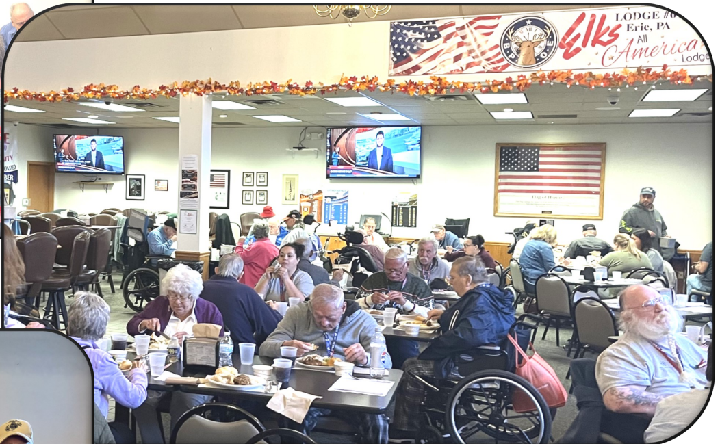
On Sunday November 10th, the Erie Elks Lodge #67 celebrated the bravery and dedication of the Marine Corp 249th Anniversary by holding a holiday Meat Raffle with the proceeds going to the local Meals on Wheels Veterans program in Erie.