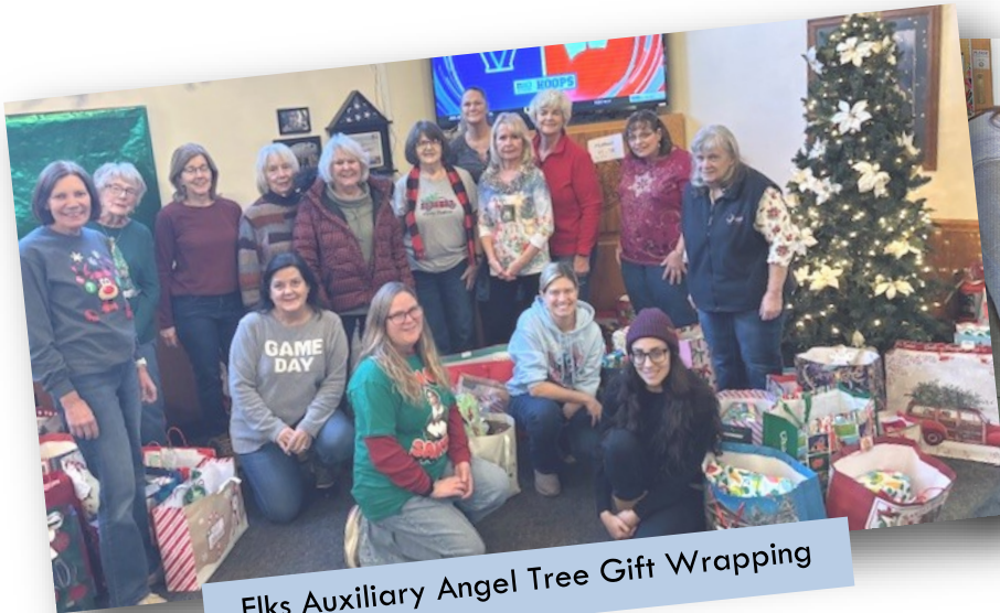
Elks Auxiliary Angel Tree Gift Wrapping

In Memoriam of the Late 32 Lodge and Auxiliary Members 2024-2025