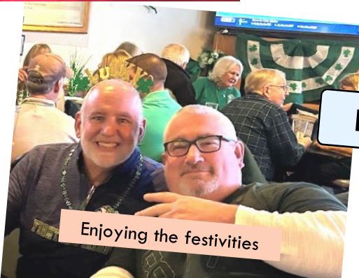
Enjoying the festivities