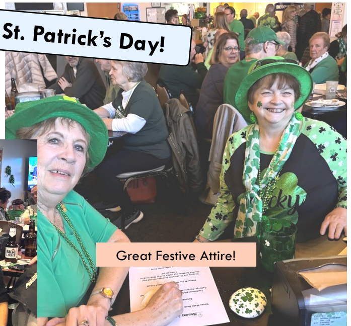
Great Festive Attire!