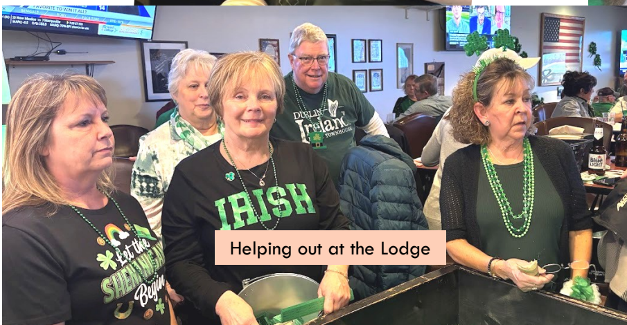
Helping out at the Lodge