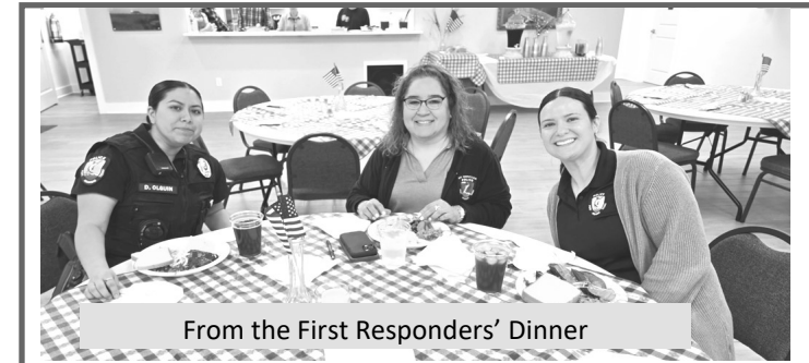
From the First Responders' Dinner