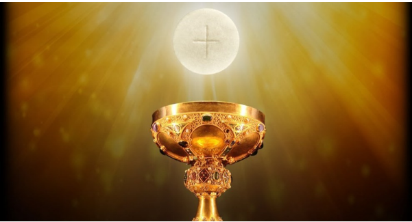
The Feast of The Most Holy Body and Blood of Christ

“May the receiving of your Body and Blood, Lord Jesus Christ, not bring me judgment and condemnation, but through your loving mercy be for me protection in mind and body and a healing remedy.”