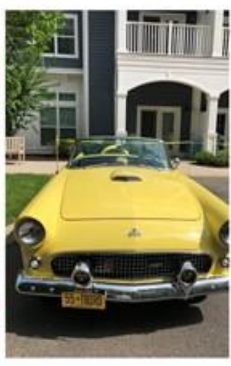
"Whenever a bird does 'that mess' on my car, I sit on my front porch and eat a plate of scrambled eggs, just to let them know what I'm capable of!"