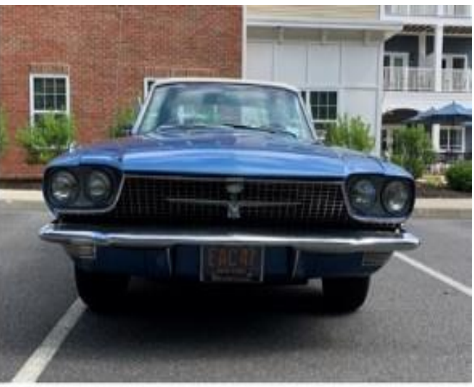
"The elderly don't drive that badly; they're just the only ones with time to do the speed limit". ~Jason Love