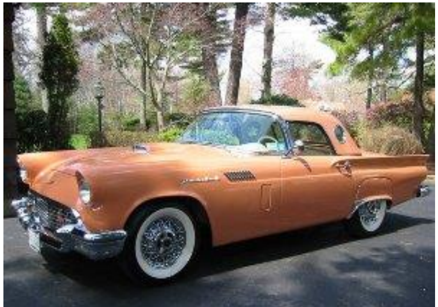
1957 Coral Sand Thunderbird

(up-coming meetings: Aug. 7, Sept. 9; Oct 8)