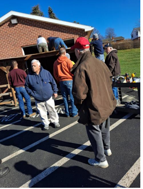
It takes a "village" and a "boss" to put up the stable.