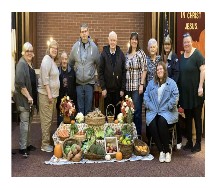
Thanksgiving bounty from the BYKOTA Class.