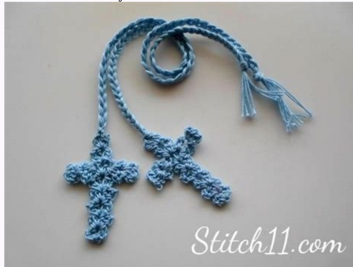
Beginner free printable crochet cross bookmark patterns.

Make anything, from home decor to accessories, a beacon of your faith with these ingeniously gorgeous crochet cross patterns. It doesn't have to be the holly-jolliest time of year or even Easter Sunday for you to enjoy these religious projects.