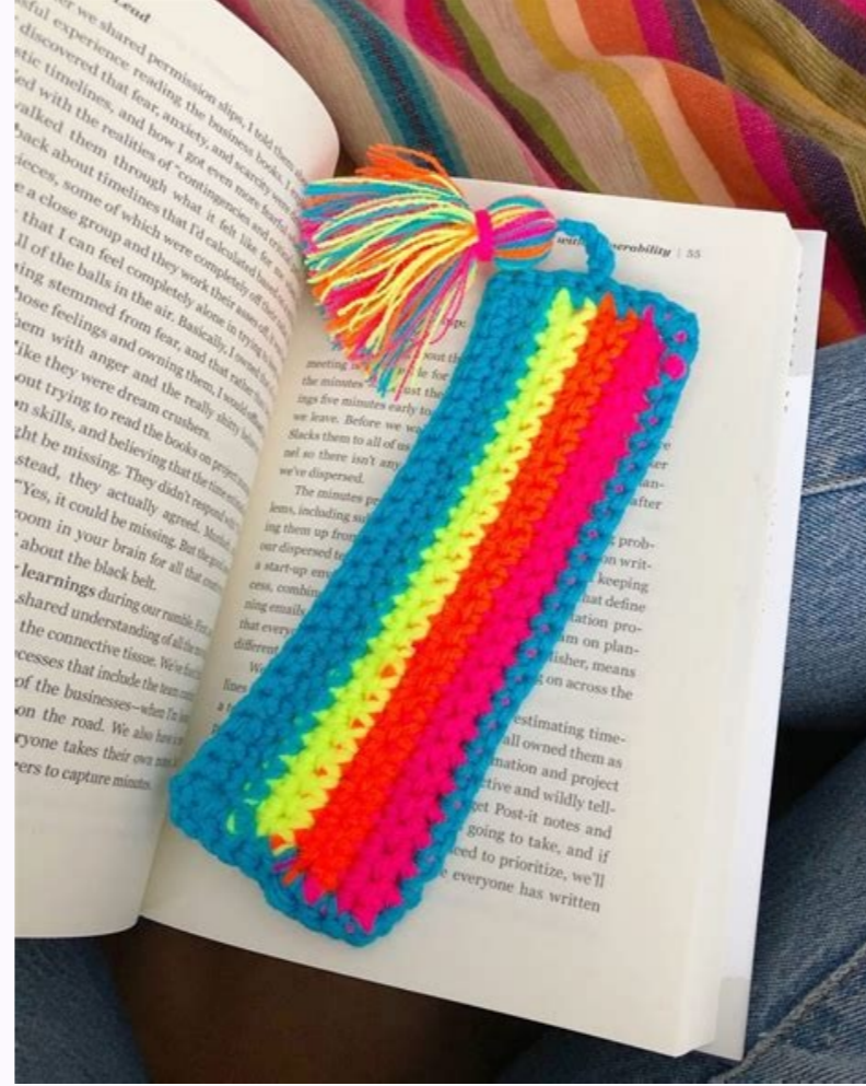
Easy bookmarks to crochet.

How to crochet a cross bookmark for beginners. How to make crochet cross bookmark. How do you crochet a cross bookmark for beginners.