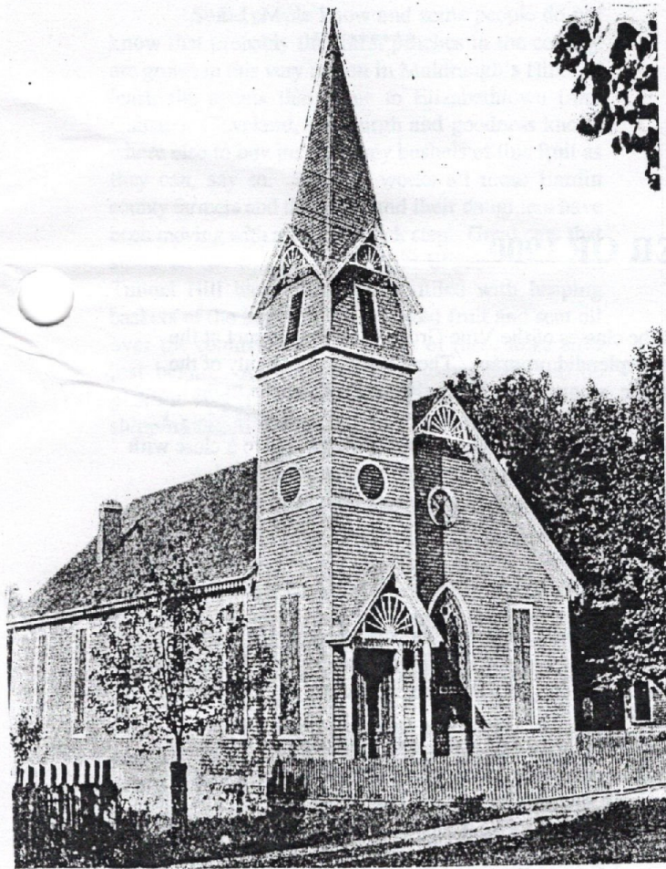
Christian Church - ca. 1881 - 1917