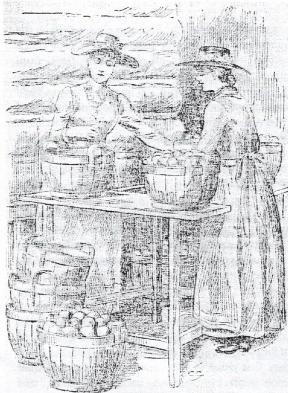
Assorting and Grading the Fruit

like the tide, will wait for no man. They must be picked before they begin to get soft, or they need not be taken off the trees at all. After the fruit has been carefully assorted, it is placed in half-bushel baskets and taken to a railroad station and shipped here, there and everywhere. The farmers and the railroad people have been at cross purposes for a long time. The country man says that the freight charges are exorbitant. Numerous are the delegations that have been sent to argue and reason with the traffic men, and numerous have been the failures. Frequently the farmers lose because they will not pull together. The more advanced fruit growers want to combine with their neighbors and use "refrigerator" cars alone, but the men who want to do as their fathers did prefer the cheaper freight cars. The latter method causes the loss of a good many dollars, as the fruit is much damaged by frequent handling. The Muldraugh's Hill farmer's idea of Arcadia is a land where railroads carry peaches for nothing.