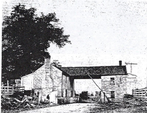
A Typical Tollgate

The charter provided that toll gates should be erected at intervals of five miles along the road, but no gate was to be placed within one mile of a city or town. Adequate penalties were provided for shunning the toll gates; but in spite of these provisions, a regular system