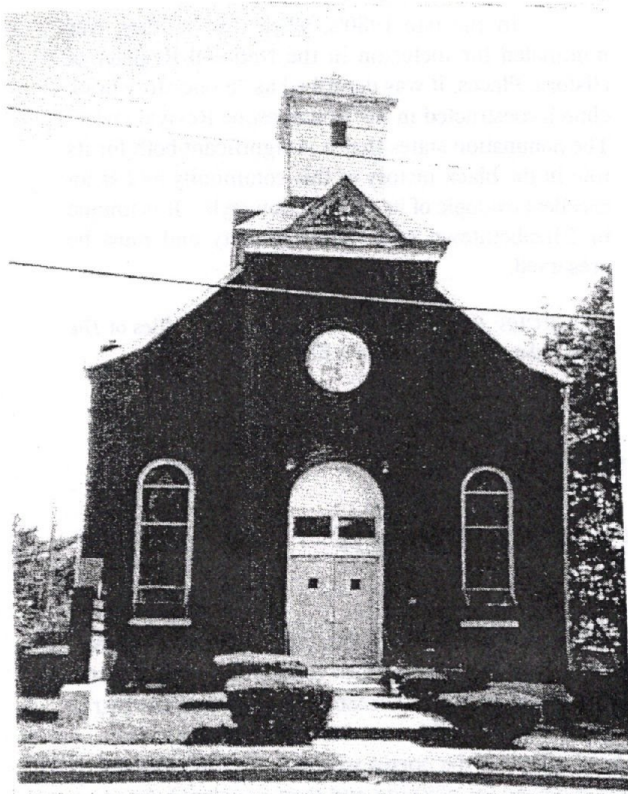
Embry Chapel AME Church (Photo Sep. 13, 2000)

Only four church buildings in Elizabethtown can claim the distinction of having existed since the nineteenth century. They are congregated in a small area in downtown Elizabethtown: the Presbyterian, the Baptist, the Episcopal, and the Embry Chapel AME. Two of these have been abandoned by their congregations and are now used for other purposes. The other two--the Episcopal and the Embry Chapel--are suffering from growing pains and are contemplating moves in the near future.