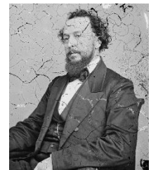
Bayard Taylor

In the book, Taylor details his trip by stagecoach from Louisville to Mammoth Cave, which includes the account of his observations of life in Hardin County during May and June 1855.