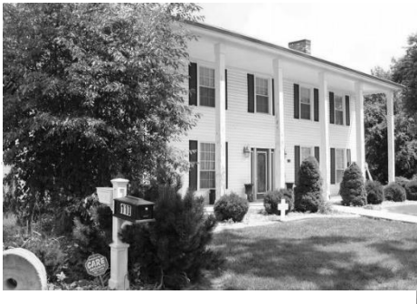
Young’s Inn at West Point, Kentucky