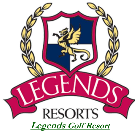
Legends Golf Resort