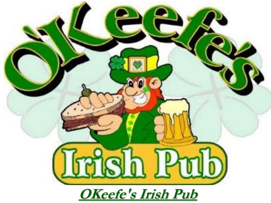
O'Keefe's Irish Pub