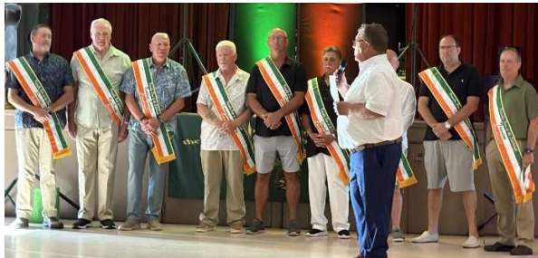
Round of Applause for the Outgoing Executive Board!