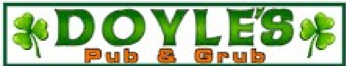
Doyle's Pub & Grub