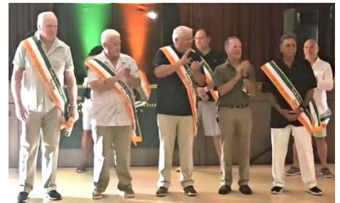
Big Welcome to the Incoming Executive Board!