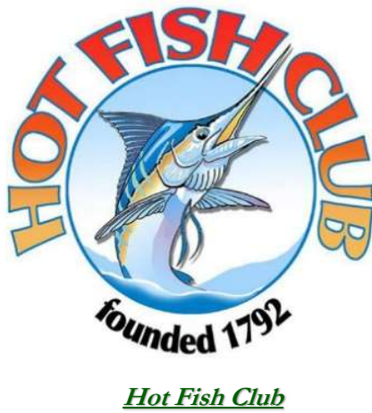
Hot Fish Club