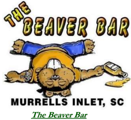
The Beaver Bar