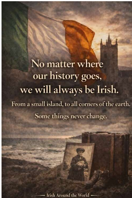
Submitted by: Don Stratton