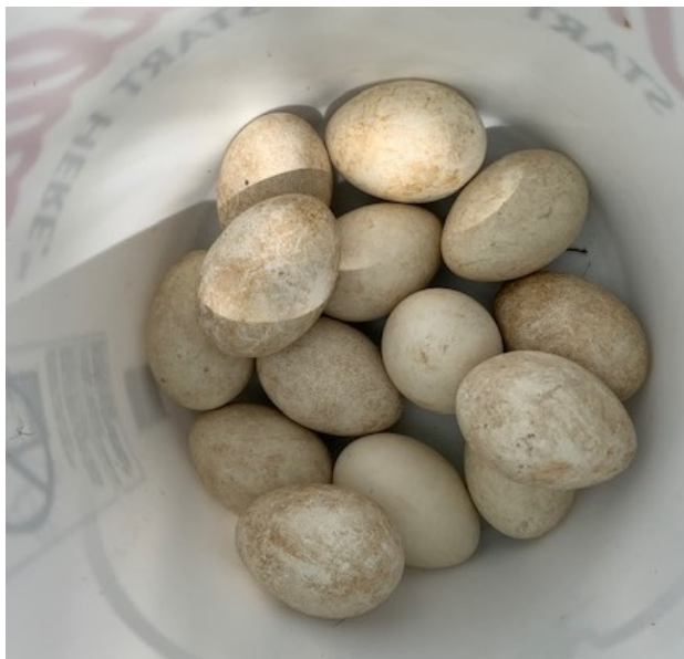
Our Goosebuster team oiled and later removed 22 eggs and removed 4 nests. Eggs were buried in the commons area as IDNR protocol suggests.