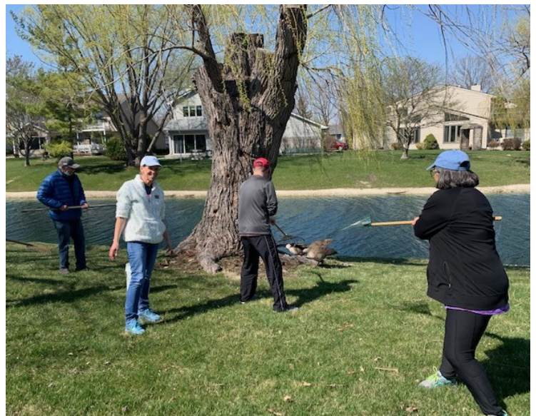
Our Goosebusters had to fend off the irate goose parents while brave souls oiled the eggs, and then several weeks later removed the eggs to bury them in the commons area.