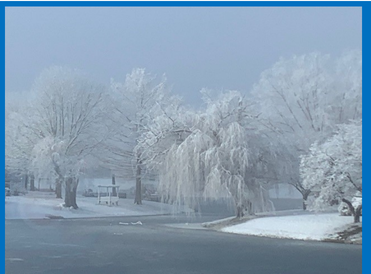
Ice and Fog on the Lake Jan. 4, 2021