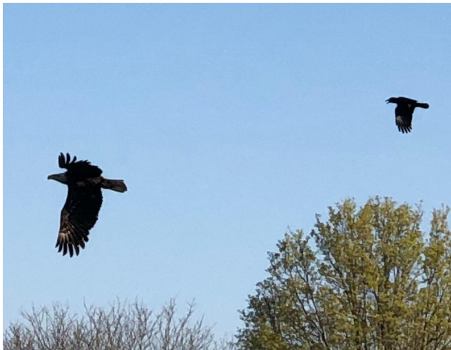
Wanpen and Paul Anderson captured the eagles flying over our lake this Spring. They were spotted last summer diving down for fish.