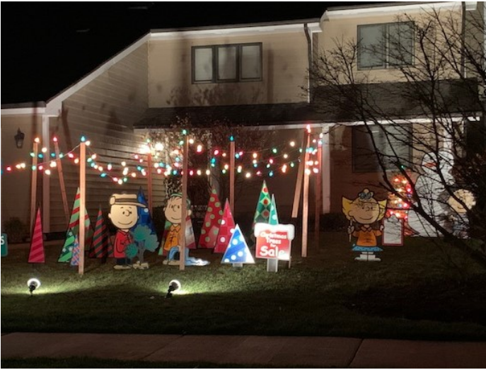
Julie and Daryn Denzer created a beautiful "Peanuts" Christmas 2020 display on Woodhaven.

Enjoy these additional pictures taken on our lake over the past year.