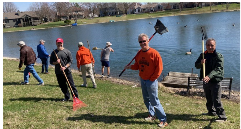
The Egg Oiling Crew on April 3