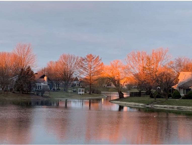
March 2023 sunrise