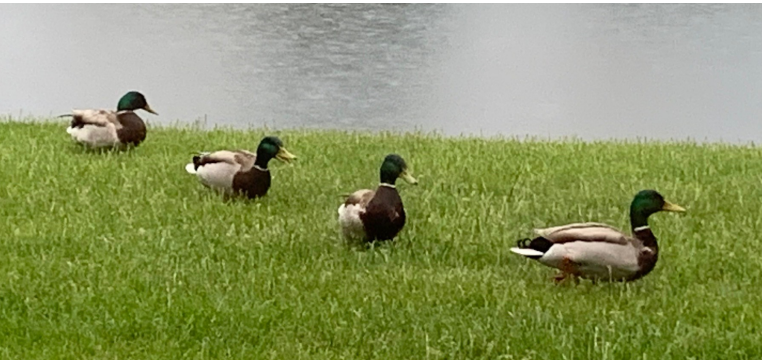
5-16-23 Mallards are welcome residents on our lake!