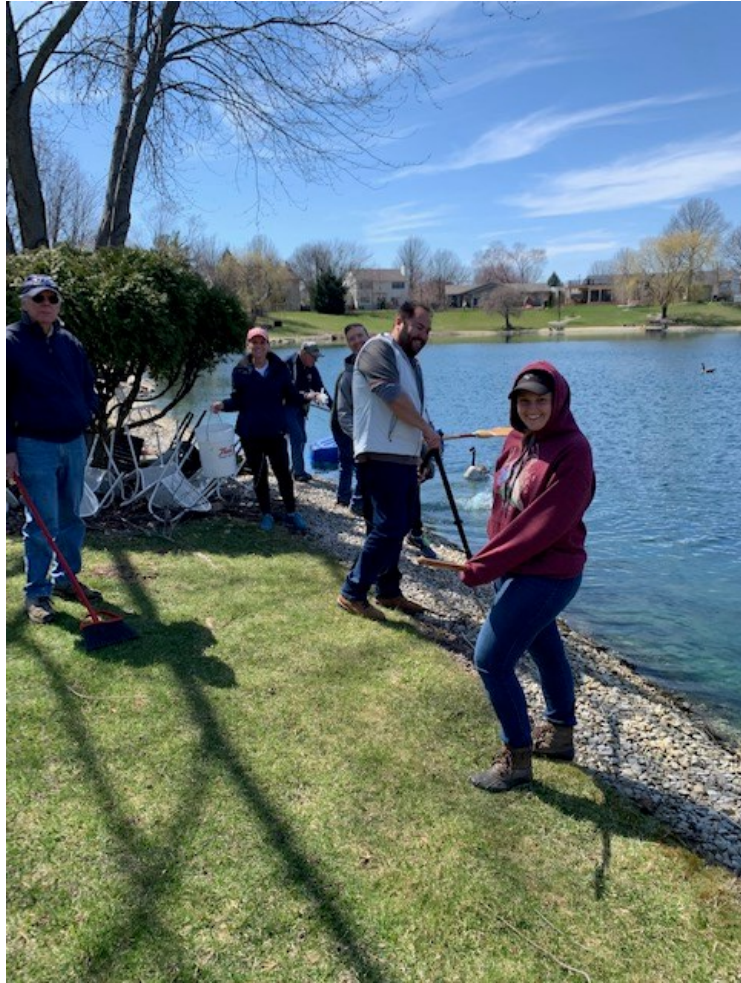
4-4-23 Goosebusters at work oiling eggs in a nest! Even the chair barricade couldn't prevent a determined goose couple from nesting and laying eggs! Multiple people have to protect the egg oiler from irate geese who try to attack and protect the nest.