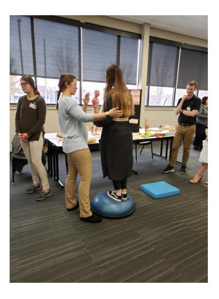
Career Expo 11-2019