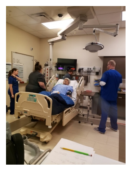
Kirkwood Simulation Center – ICU

In the Academy, I generally have an average of 250 students in the 7 county area each year. Students have the opportunity to earn 12.5 college credit hours while in high school, while also earning their CNA. I have a wonderful opportunity to partner with the Health Care Sector Board to offer some awesome experiences for