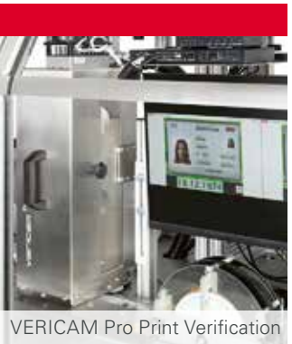
VERICAM Pro Print Verification