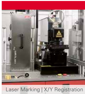
Laser Marking | X/Y Registration