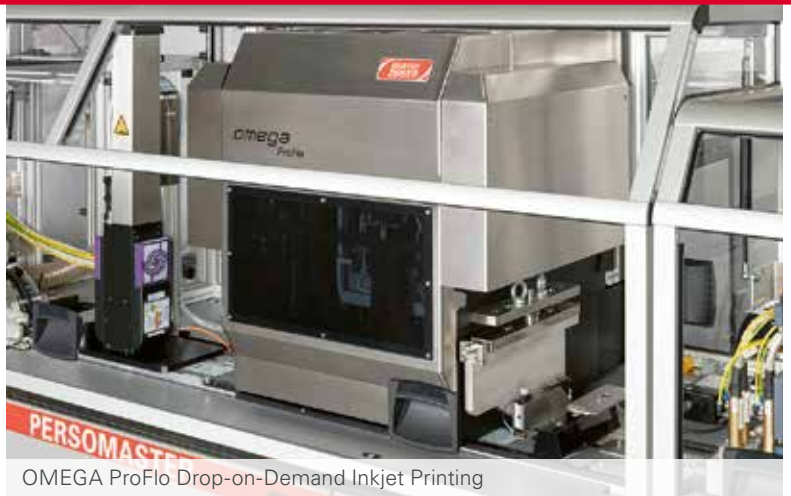
OMEGA ProFlo Drop-on-Demand Inkjet Printing