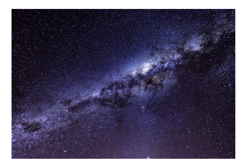
April 8 - New Moon. The Moon will located on the same side of the Earth as the Sun and will not be visible in the night sky. This phase occurs at 18:22 UTC. This is the best time of the month to observe faint objects such as galaxies and star clusters because there is no moonlight to interfere.

April 8 - Total Solar Eclipse. A total solar eclipse occurs when the moon completely blocks the Sun, revealing the Sun's beautiful outer atmosphere known as the corona. This is a rare, once-in-a-lifetime event for viewers in the United States. The last total solar eclipse visible in the continental United States occurred in 2017 and the next one will not take place until 2045. The path of totality will begin in the Pacific Ocean and move across parts of Mexico and the eastern United States and Nova Scotia. The total eclipse will be visible in parts of Texas, Arkansas, Missouri, Illinois, Indiana, Kentucky, Ohio, Pennsylvania, New York, Vermont, New Hampshire, and Maine.