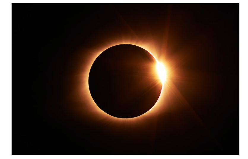
October 2 - New Moon. The Moon will located on the same side of the Earth as the Sun and will not be visible in the night sky. This phase occurs at 18:51 UTC. This is the best time of the month to observe faint objects such as galaxies and star clusters because there is no moonlight to interfere.

October 2 - Annular Solar Eclipse. An annular solar eclipse occurs when the Moon is too far away from the Earth to completely cover the Sun. This results in a ring of light around the darkened Moon. The Sun's corona is not visible during an annular eclipse. The eclipse path will begin in the Pacific Ocean off the coast of South America and move across parts of southern Chile and Argentina. A partial eclipse will be visible throughout most of southern South America.