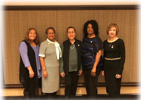
QI Board of Directors

In closing, please allow me to take this opportunity to wish you and your families a Joyous Holiday Season. Quota's members are our organization's greatest blessing, and we thank you for all that you do in Quota's name in service to your community and our world.