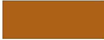
Terra Cotta Code S1