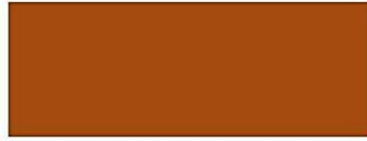
Tile Red Code S1