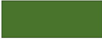
Green Code S3