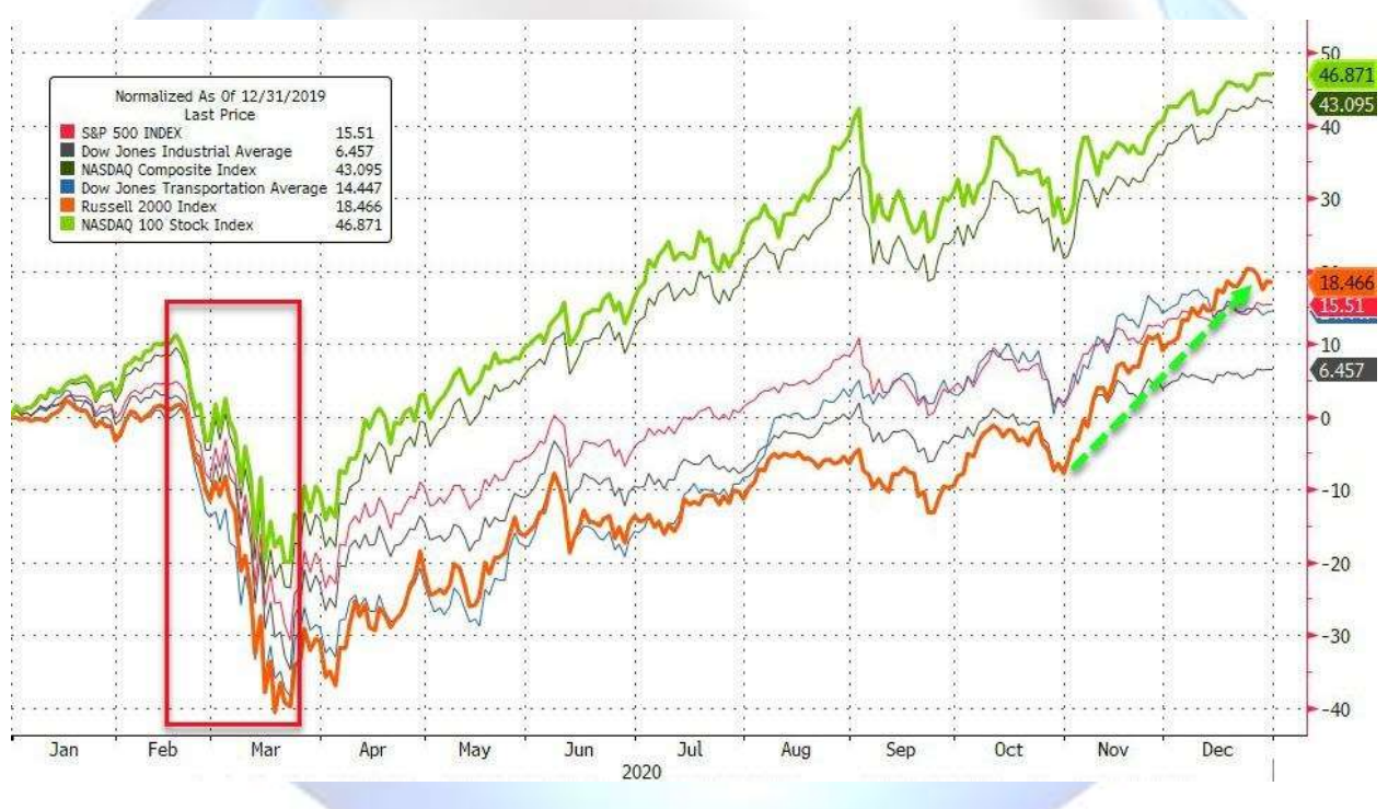
Source: Bloomberg https://www.zerohedge.com/markets/15-trillion-tsunami-2020-crashes-dollar-sparks-golds-best-year-decade

The U.S. stock market, shown below, had quite the wild ride in 2020, though finishing with a positive upswing in December and many indices finishing at all-time highs. The Dow Jones Industrial Average climbed +3.27%, the S&P 500 rallied +3.71%, and the small cap Russell 2000 jumped +8.52%. The international markets followed a similar path as the U.S. The MSCI EAFE iShares Core International Developed Markets ETF Index rose +4.97% and the MSCI Emerging Markets iShares Core ETF Index soared +7.30%.