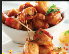
BACON SCALLOP 12.95