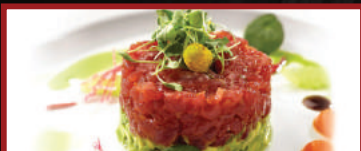
SPICY TUNA OR • 11.95 SPICY SALMON TARTAR