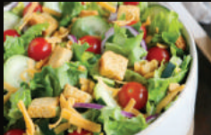
HOUSE SALAD 4.95