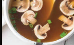
ONION SOUP 2.50