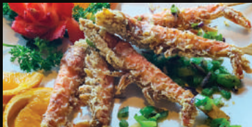
SALT & PEPPER FRIED SHRIMP 11.95 (Made fresh to order, longer cook time)