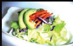
AVOCADO SALAD 6.95