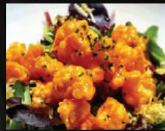
ROCK SHRIMP 11.95