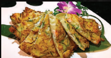
SEAFOOD SCALLION PANCAKE 12.95 (Made fresh to order, longer cook time)