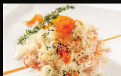
KANI SALAD 6.95