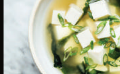
MISO SOUP 2.50