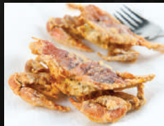
SOFT SHELL CRAB 12.95