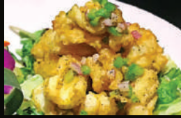
FRIED CALAMARI 11.95