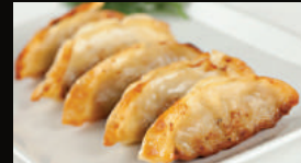
FRIED GYOZA 5.95