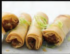
FRIED SPRING ROLL 4.95