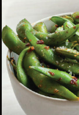
GARLIC EDAMAME 5.95