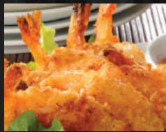
COCONUT SHRIMP 11.95