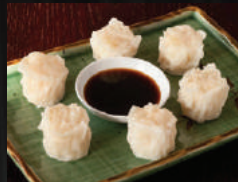
SHRIMP SHUMAI 4.95