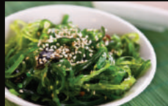
SEAWEED SALAD 6.95