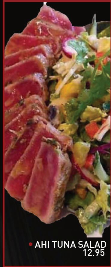
• AHI TUNA SALAD 12.95