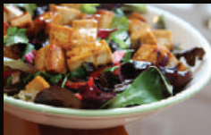
TOFU SALAD 7.95