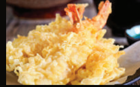
SHRIMP TEMPURA 7.95