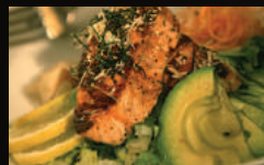
GRILLED SALMON SALAD 12.95