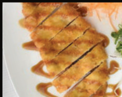
FRIED CHICKEN 5.95