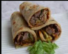
BNACHO SHRIMP 10.95