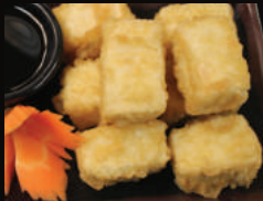
FRIED TOFU 4.95