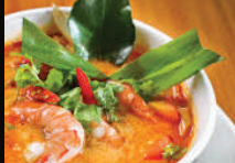
TOM YUM SOUP 6.95