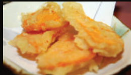
SWEET POTATO TEMPURA 5.95