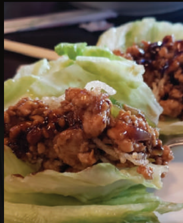
CHICKEN LETTUCE WRAP 11.95