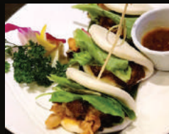
PORK/BEEF BUN 10.95