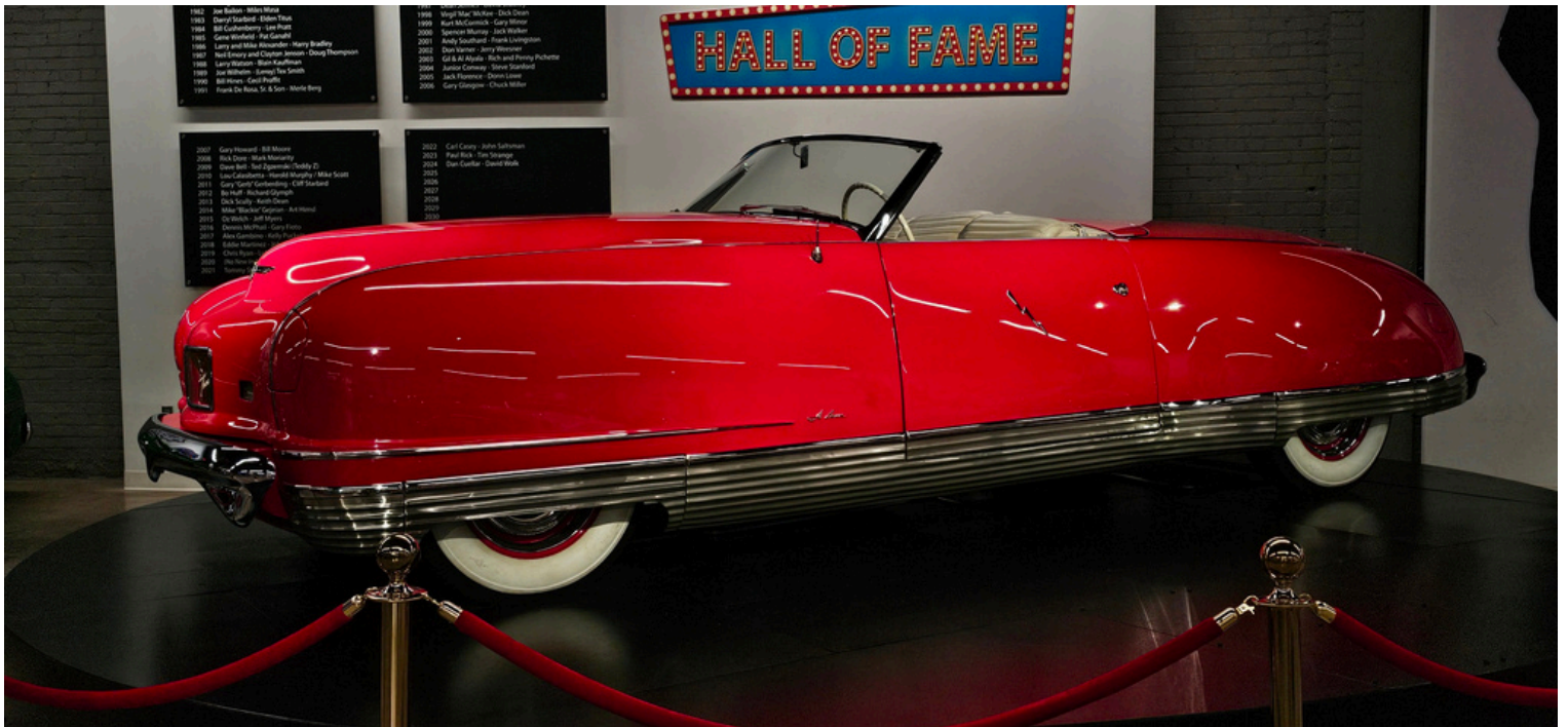
1941 Chrysler Thunderbolt

Salina, KS 67401 134 S 4th St. SALINA, KS GARAGE THE AUTOMOTIVE MUSEUM