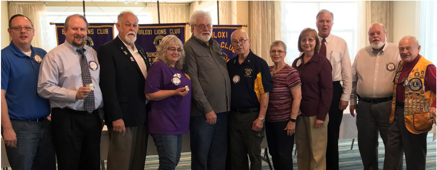
February 27, 2019 Avery McKinley Pin recipients: L to R: