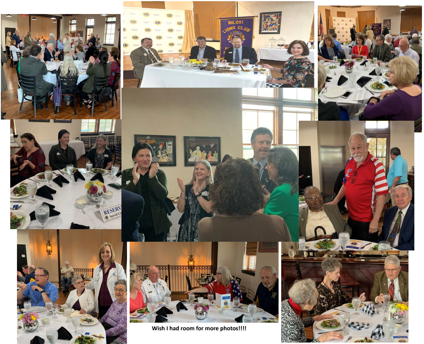
Wish I had room for more photos!!!!